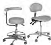
Signature Stool Package $799