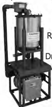
Roadrunner Hybrid Dry Vacuum System $5495

All our Parts are Made in the USA Visit our Factory to see equipment being Manufactured