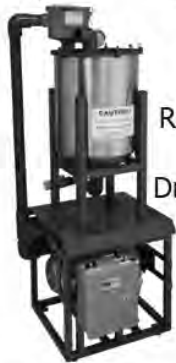
Roadrunner Hybrid Dry Vacuum System $5495

All our Parts are Made in the USA Visit our Factory to see equipment being Manufactured