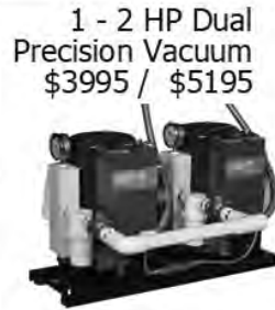
1 - 2 HP Dual Precision Vacuum $3995 / $5195