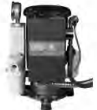
Infinity Delivery System $2795