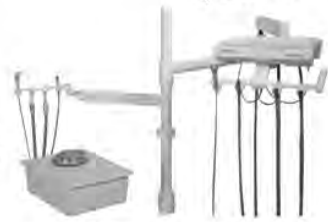
10 Year Warranty