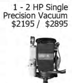
1 - 2 HP Single Precision Vacuum $2195 / $2895