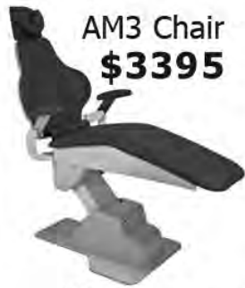
AM3 Chair $3395