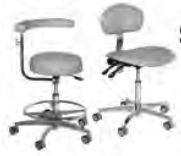
Signature Stool Package $799